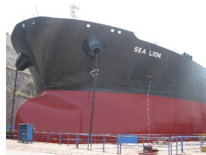
MT "SEA LION" inside the Graving Dock of ZHOUSHAN IMC YY SHIPYARD

(4) Gantry Cranes : 50T × 1set, 30T × 1set