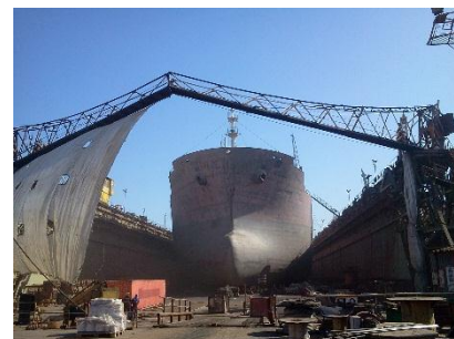
MT "ANTEA" Drydocking in DESAN YARDGEM Shipyard

Tuzla Area is a Shiprepair Base with several Shipyards providing Services therefore Specialists and Subcontractors can be available at short notice.