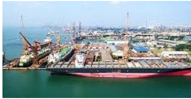
Jurong Shipyard of Sembcorp Marine