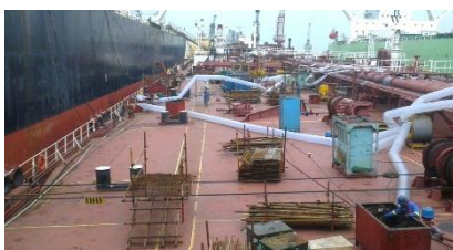
MT "CAP ROMUALD" Alongside in Yuilian Shekou Dockyard